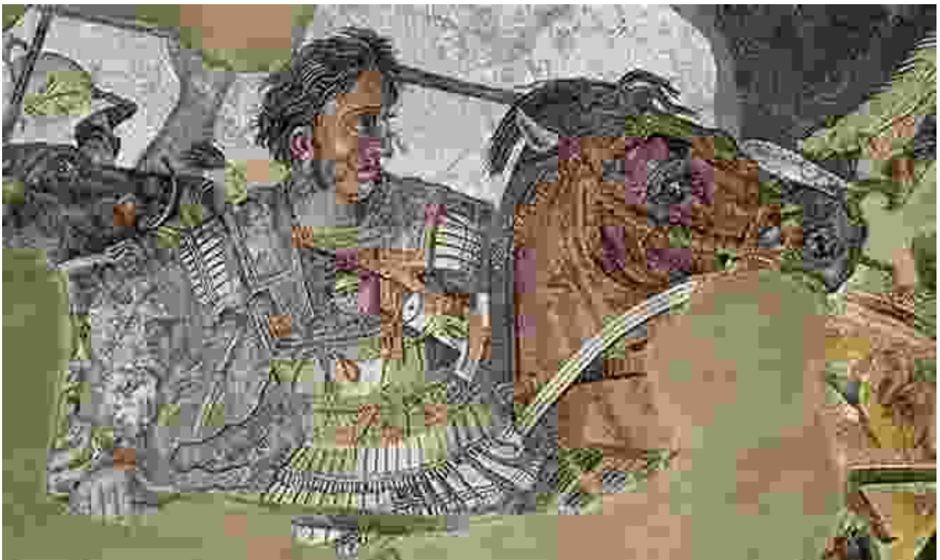
Alexander the Great depicted in a mosaic

Alexander's legacy extended beyond the realm of politics and warfare. He was a patron of the arts and sciences and played a key role in the development of Hellenistic culture. Alexander's court was a center of learning and culture, and he commissioned some of the greatest works of art and architecture of the ancient world.