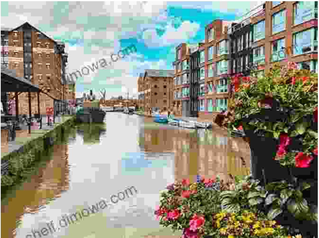
Gloucester Docks, a vibrant cultural hub

Gloucester has played a pivotal role in English history. It was once the capital of the powerful Kingdom of Mercia and later became a center of the wool trade. The city is home to the Gloucester Docks, once a bustling port that now houses museums, galleries, and a thriving cultural scene. The City of Gloucester In Pictures transports you back in time, capturing the vibrant history and cultural heritage that permeate every corner of this ancient city.